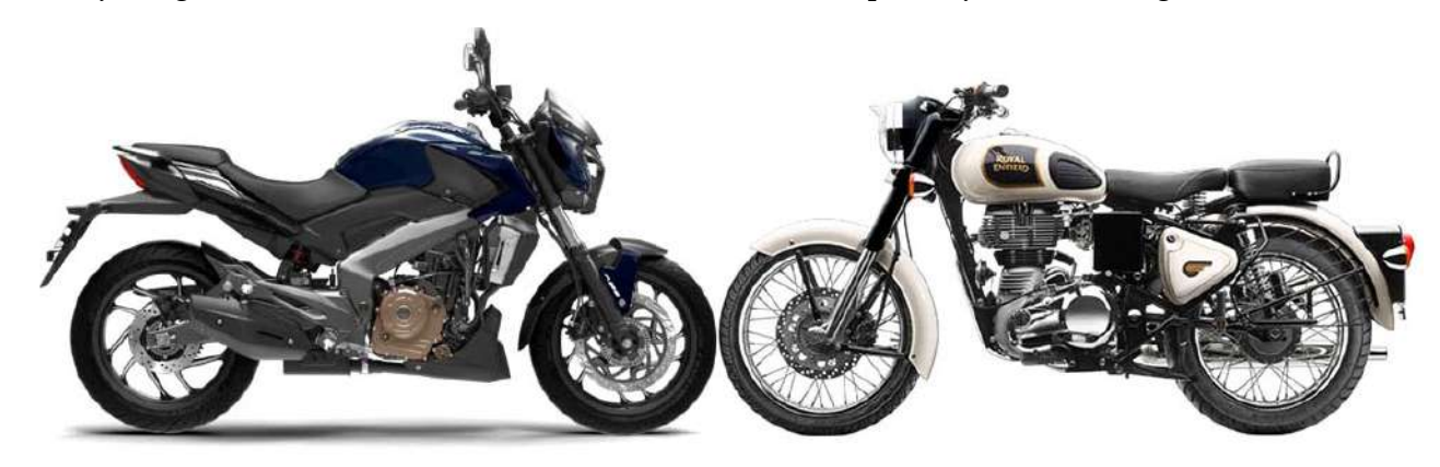
Bajaj Dominar 400cc (non-metal) and Royal Enfield motorcycle500cc (metal)

The major reason for the tedious process of selecting a member is making sure that the prospects have learnt the normative ways of behaviour eventually leading to ethnocentrism. The normative culture of any motorcycle establishment demands ethnocentric attitudes. The unique ways of inducing the ethnocentric