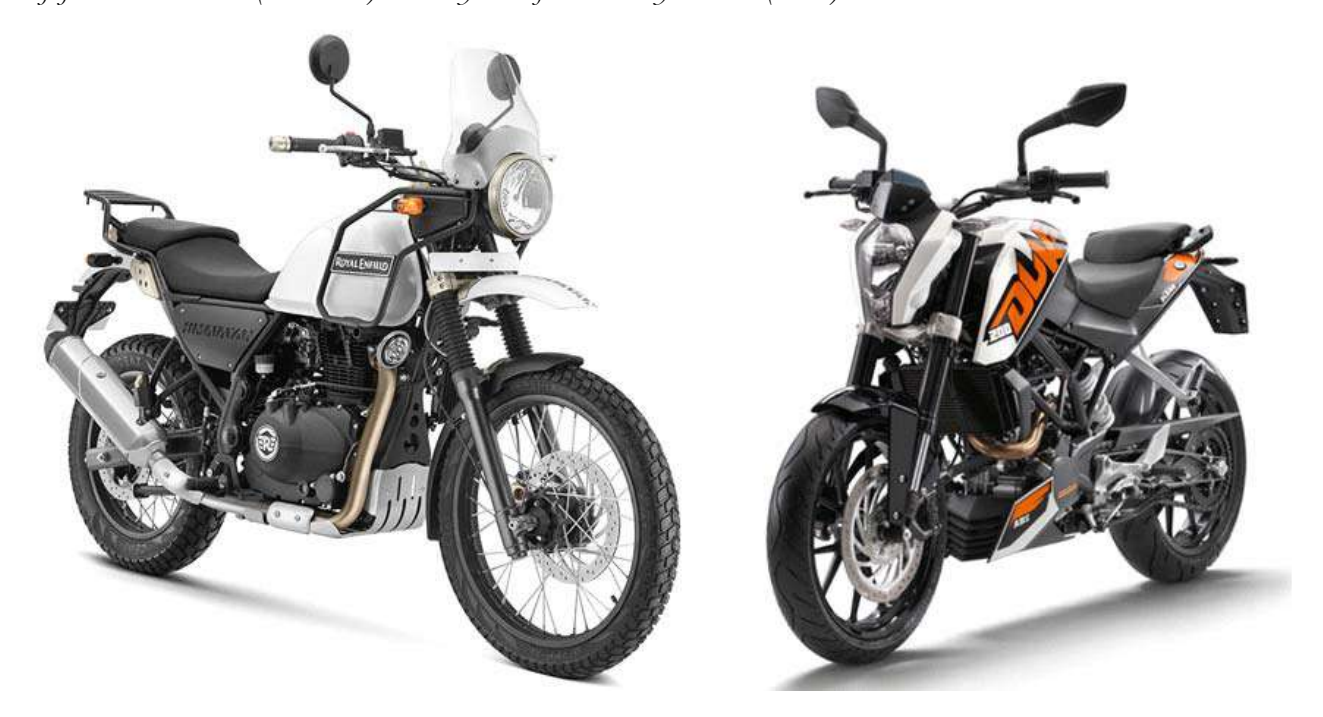
Royal Enfield 411cc (metal) and KTM Duke200cc (plastic/non-metal)